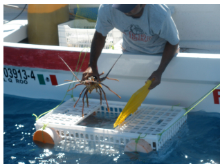
7. Lobster captured under specific conservation and sustainable use measures

Some of the key factors required by the collective brand "Chakay" include: