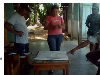
5. Discussion meetings have taken place in San Juan Village, Buena Vista Village and Livingston

Fishermen have proposed to declare a "no trawling zone" within the Río Sarstún Protected Area. The fishermen from different associations, all members of the Fishermen's Network of the Guatemalan Caribbean, participate in the discussions.