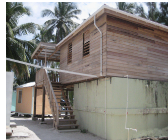
3. Tobacco Caye Marine Station

Located in South Water Caye Marine Reserve, this station is a training center where educational activities will be conducted and information will be produced.