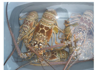
10. Healthy mature lobsters.