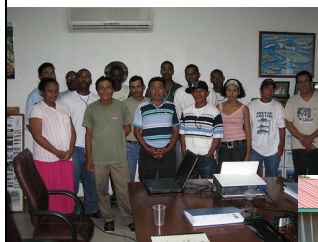
1. Community leaders from both Payne's Creek National Park and Port Honduras Marine Reserve Protected Areas that have joined the training program.

The relations between TIDE personnel and coastal community leaders chosen from Payne's Creek National Park and Port Honduras Marine Reserve have been strengthened through educational sessions and meetings. Leaders have learned new skills, such as basic computer use and effective communications, which makes them important multipliers of conservation information.