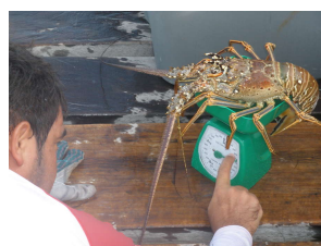
8. Minimum Legal weight