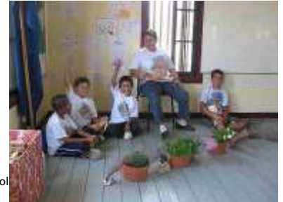
6. Kids from the elementary school participating in "Save the babies"

The Environmental Education Plan is under implementation in Utila Island. It includes providing information on local ecosystems and the impact that human activities have on the environment. One of the activities involves children from the elementary school at Pigeon Caye. As part of the program on management of natural resources, they are developing a dramatization called "Save the babies", in reference to the protection of immature Queen Conch.